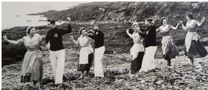
Manx dancers performing Flitter Daunsey