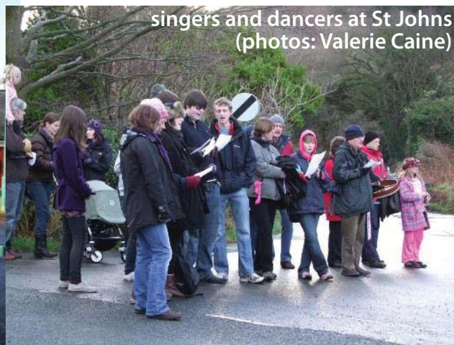
singers and dancers at St Johns