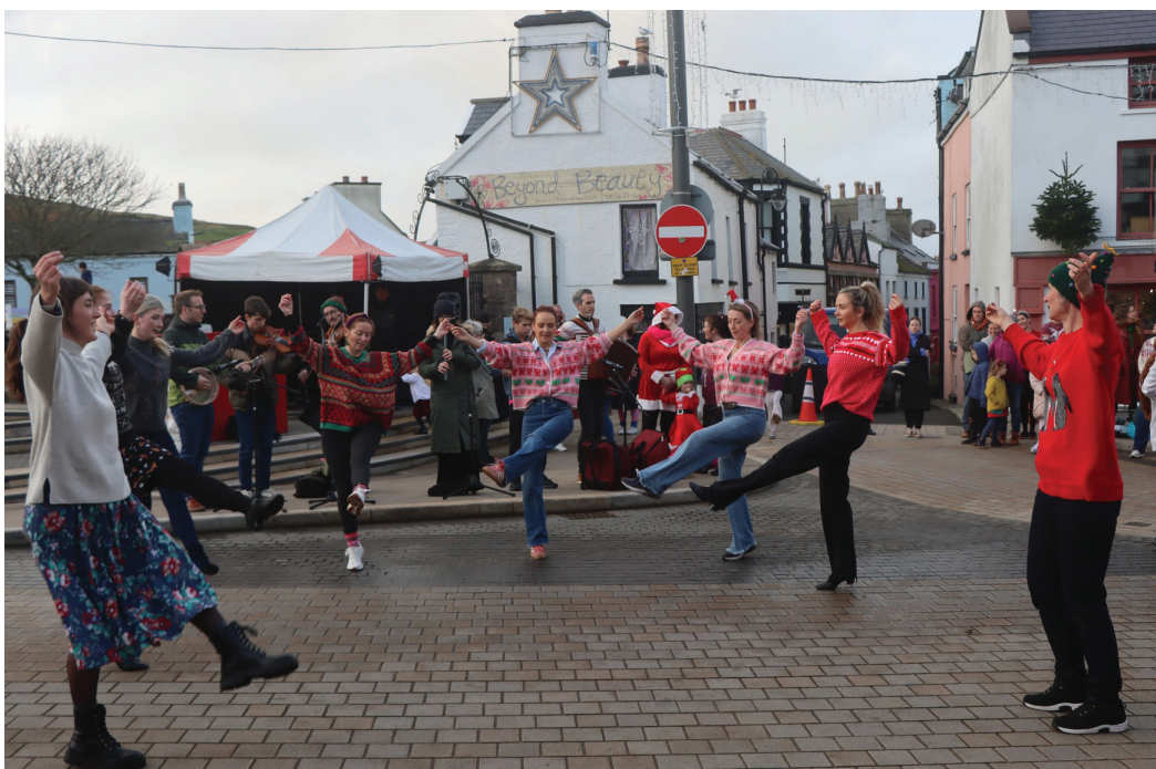
Skeddan Jiarg performing "Shooyl Inneenyn" at Peel Christmas Light Switch On (30.11.24)