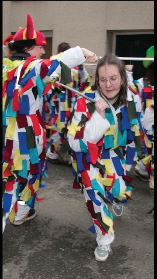
Two sets of lairy White Boys hit the streets of the Isle of Man on 21st December!