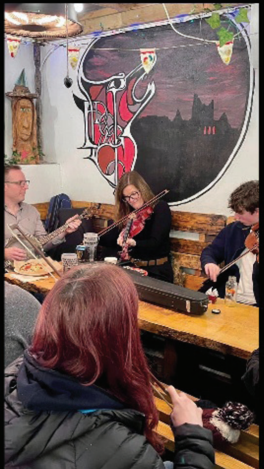
Top Left - clockwise: Black Dog Oven; Cammag Session in the Tynwald Inn, St Johns & Skeddan Jiarg musicians in Peel.