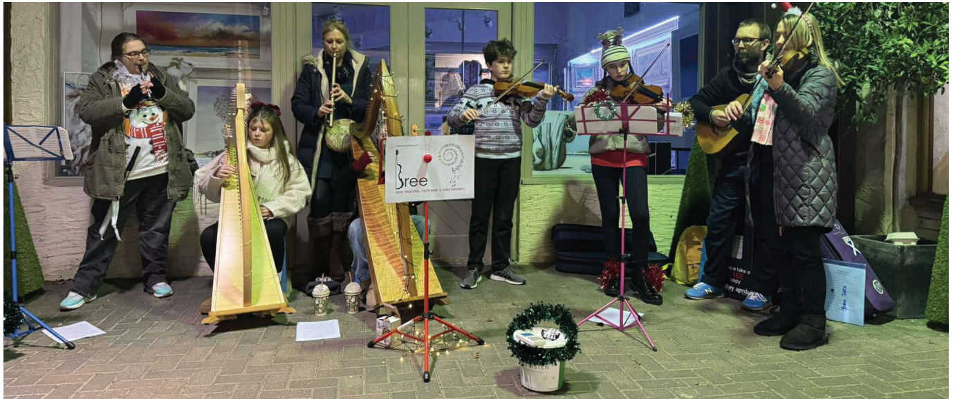
Bree Manx music group busking at Tynwald Mills in aid of Isle Listen (10.12.24)