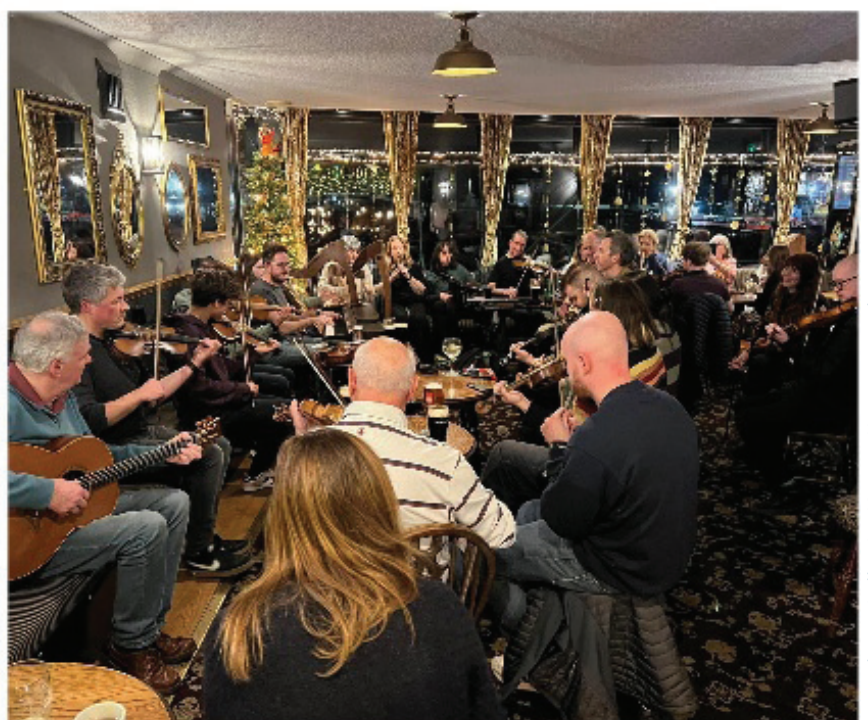
There were tonnes of music sessions over the Kegeesh Ommidjagh (Foolish Fortnight)! Top Left - clockwise: Fyn Bar in Ramsey; Iliam Dhone session at the Sidings, Castletown; 25th anniversary Mitre session in Ramsey; youth trad session at the Mitre and Cammag session in the Tynwald Inn.