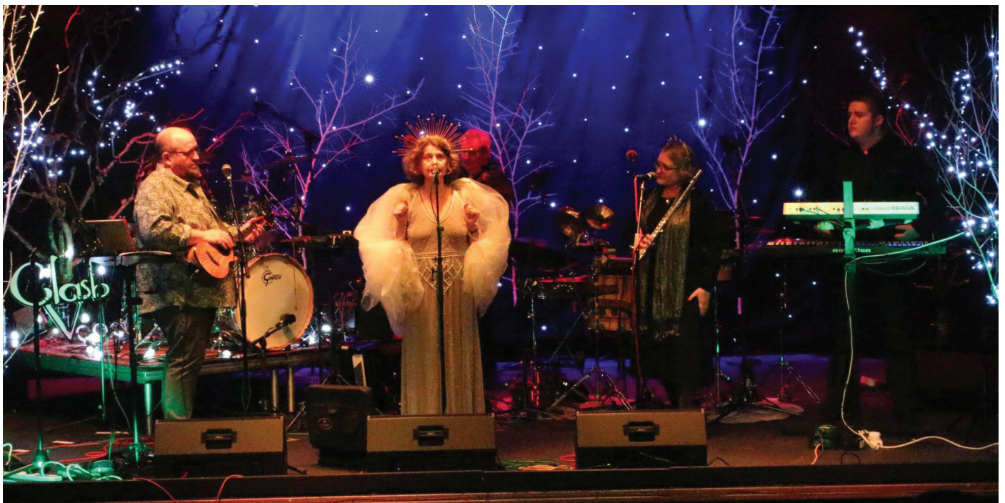
Clash Voar at Peel Centenary Centre (27.12.24)