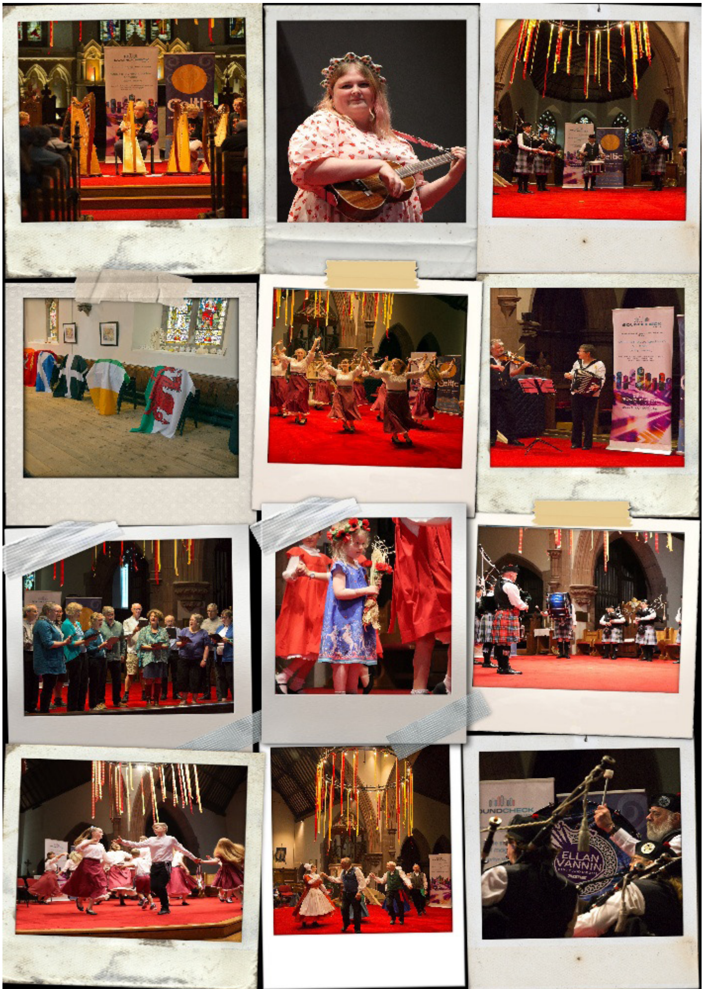
Saturday Gathering at the Cathedral with Share na Veg, Biskee Brisht, Skeddan Jiarg, Pen y Fai, Caarjyn Coidjagh, Ellan Vannin Pipes & Drums & Perree Bane