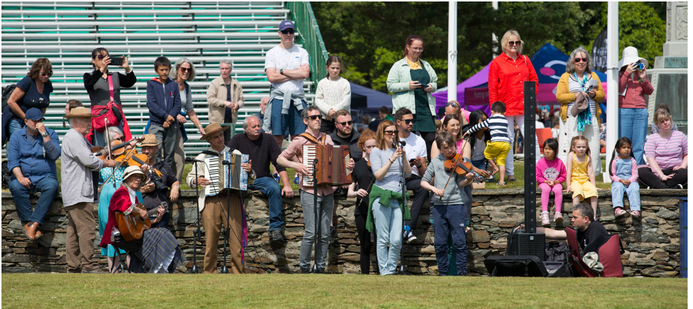
The sun shone for the 'Grand Manx Dance' at Tynwald Day this year (5 July)