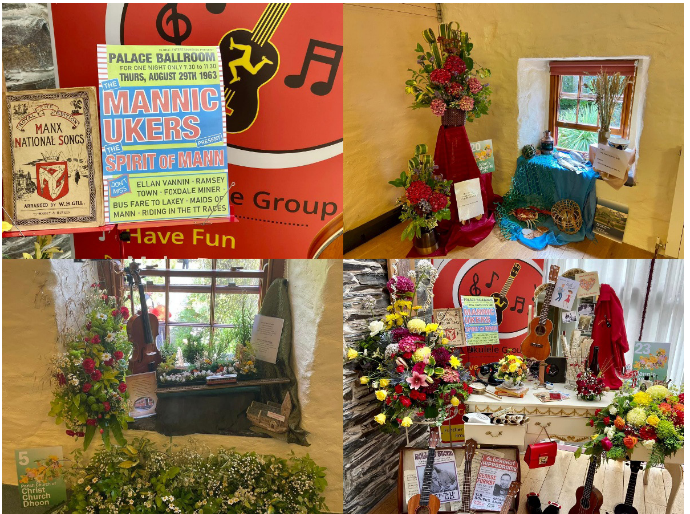
Musical highlights from the IOM Flower Festival in St John's Mill. The theme was 'The Spirit of Mann – Spyrryd Vannin'. The Mannic Ukers, The Green Hills of Dhoon & The Manx Fishermen's Evening Hymn featured.