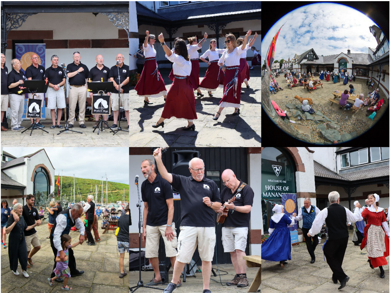
Entertainment from Bryher's Boys, Skeddan Jiarg & Pen y Fai outside the House of Manannan and daily lunchtime sessions in Noa Market Hall.