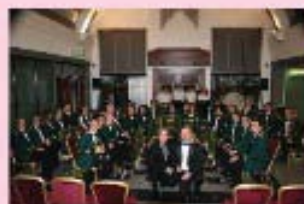
Douglas Town Band