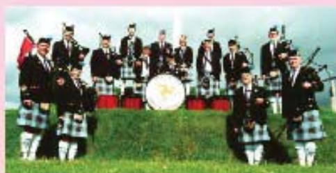
Ellan Vannin Pipes & Drums

Come and enjoy the very best in contemporary Manx Music-making and dance — from traditional Manx tunes to new work drawing on a wealth of Celtic and folk music