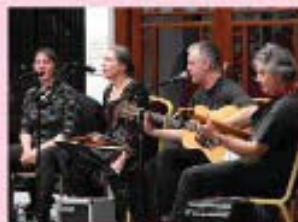
The Mollag Band

8.00pm Villa Marina Arcade Douglas Admission Free