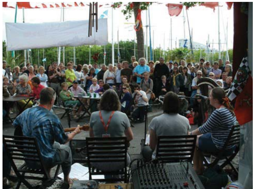
views from the IOM pavilion when the Mollag Band were playing