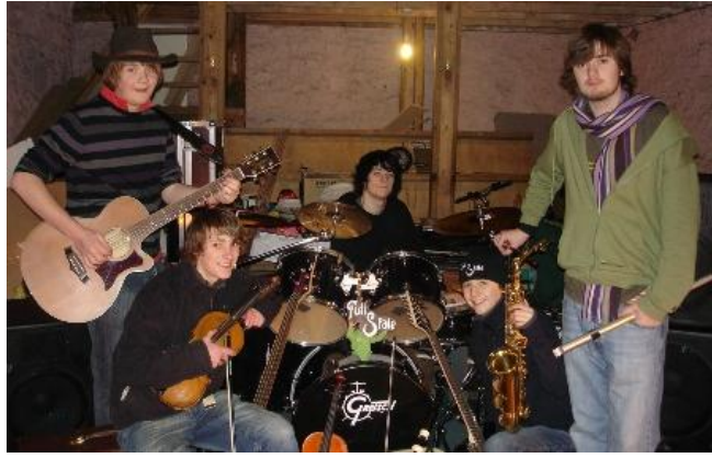
Full Spate from Scotland

This year's Shennaghys Jiu takes place over the Easter weekend 21-24 March . Featuring the wonderful, amped up Full Spate, from Scotland, it promises to be a lively mix of Manx and Celtic music and dance.