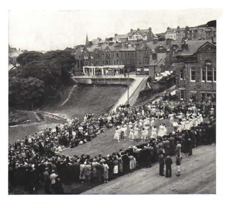
FOLK DANCING is a popular pastime for school children in the Isle of Man and here you see the children at Port St. Mary performing a traditional dance on the green sward facing the Promenade and Chapel Beach.

www.musicladycarolonlinestore.com/new-manx-music.html