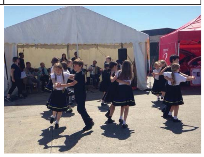
Scoill Phurt le Moirrey dancing at the Queenie Festival