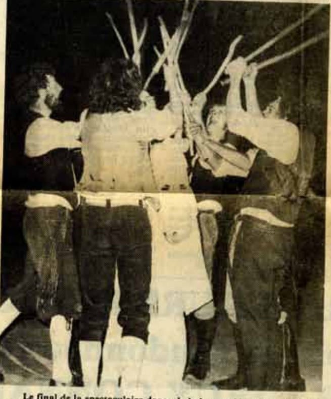
Le final de la spectaculaire danse de la jument blanche (Las Vane) mardi soir au Moustoir. Les danseurs de l'île de Man ont créé la surprise et recueilli les applaudissements nourris des spectateurs.

kiaull manninagh jiu 08/15 culture vannin