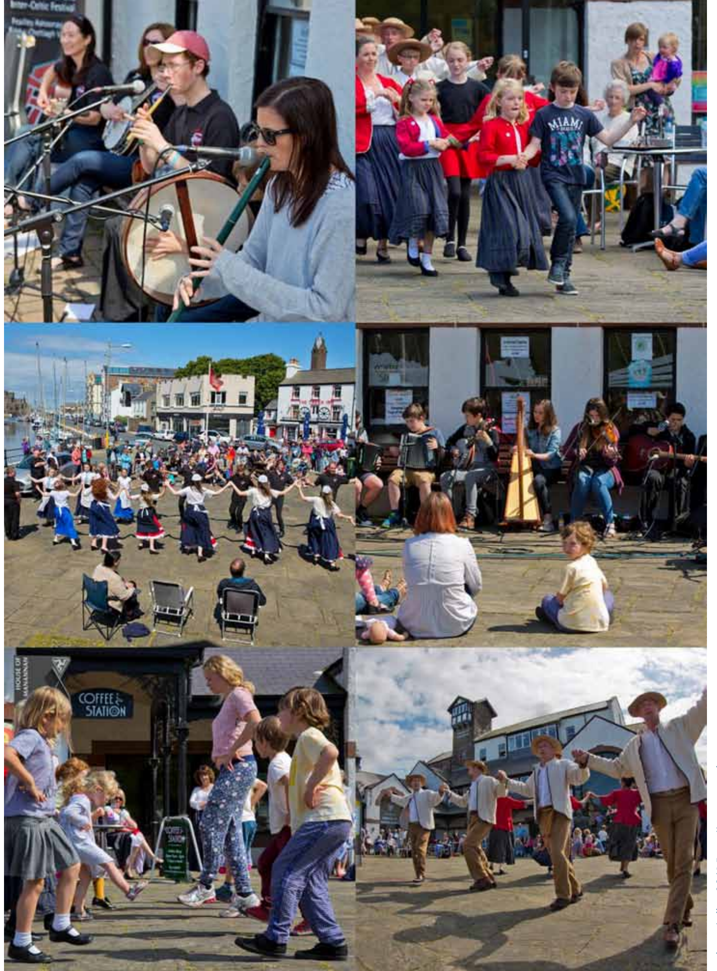
A beautiful final day in Peel with Manx dance and music displays outside the House of Manannan: Ny Fennee, Bree Supergroup, Perree Bane and the 'Manannan Babes'!