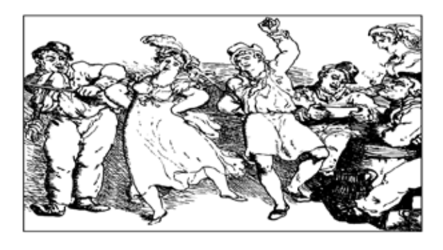
Free Admission! Donations to 'Friends of Ballaugh School'

Ballaugh Parish Hall Saturday, September 13<sup>th</sup>, 2014 7:00 – 9:30pm