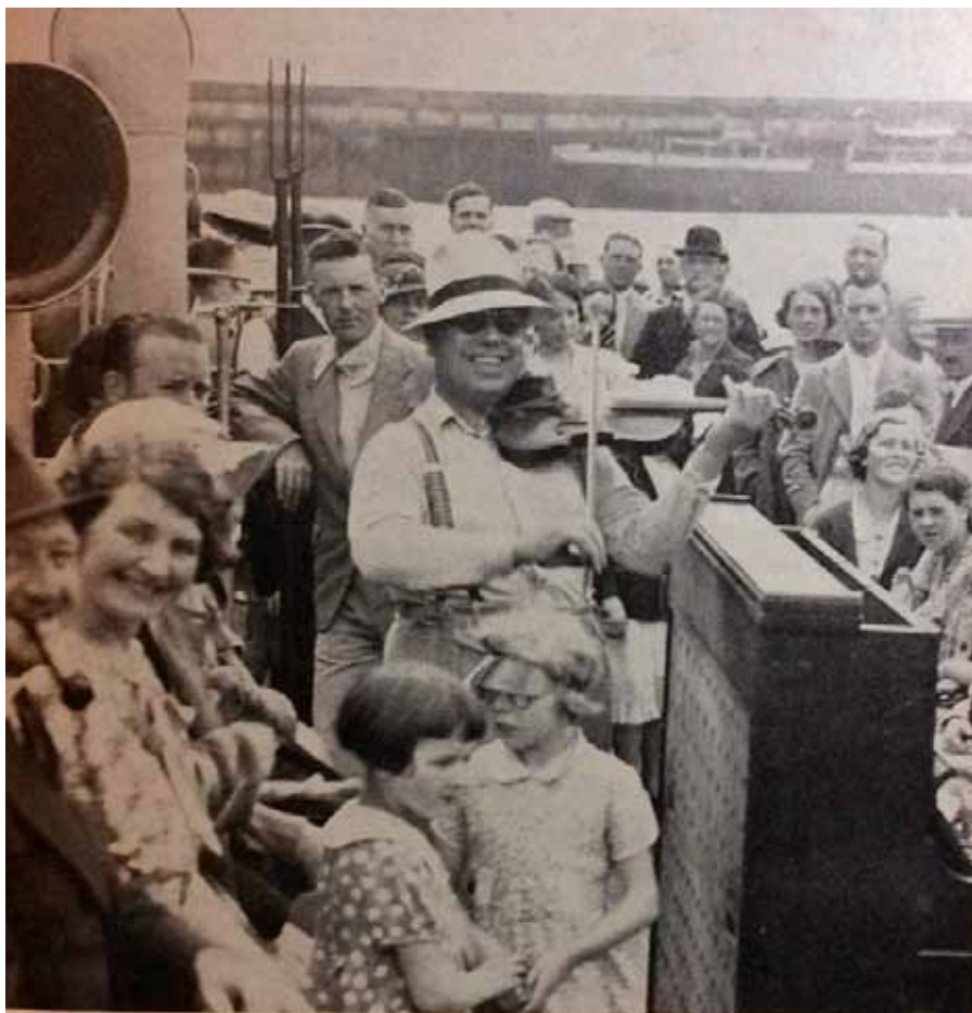
“ON A STEAMER GOING OVER.”