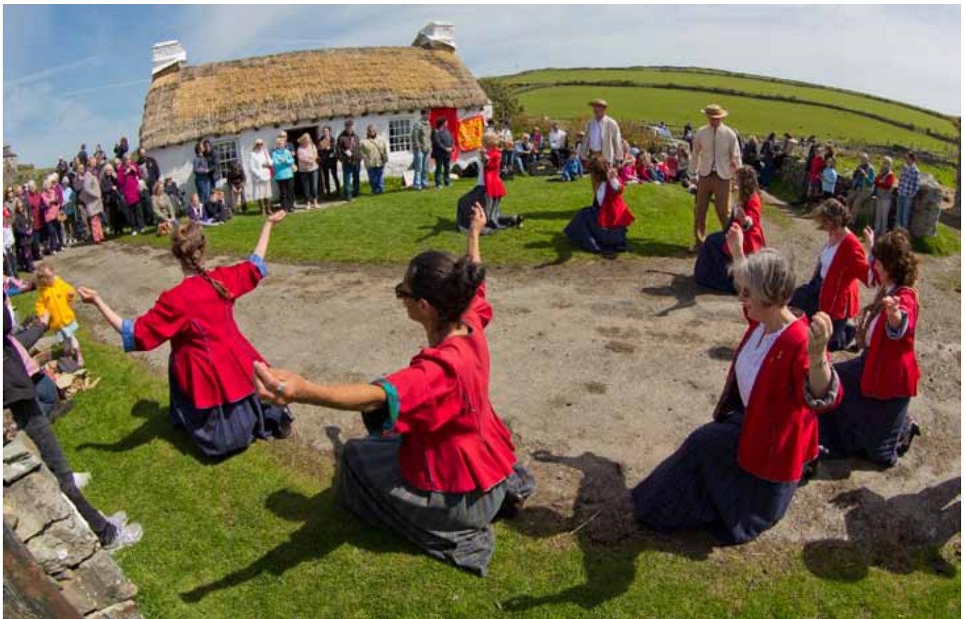
M anx dance group Perree Bane were busy last month. Here they are at Cregneash on May Day, and again at the Harbour 2 Harbour walk in Castletown, sharing the bill with talented youngsters from Bree buskers & the Bree Supergroup. You can see and hear both groups this summer at the IOM Arts Council Summer Season, Tynwald Day, Yn Chruinnaght and other events.