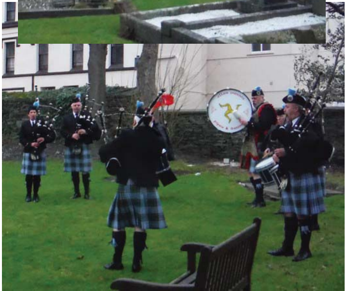
EVPD at RNLI service

Please send in dates so that we can publicise events here & online: